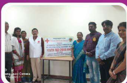
Youth Red cross unit Inauguration Ceremony