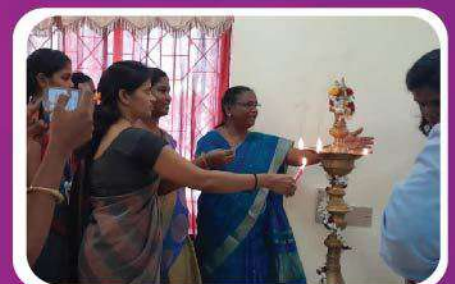
Youth Red cross unit Inauguration Ceremony