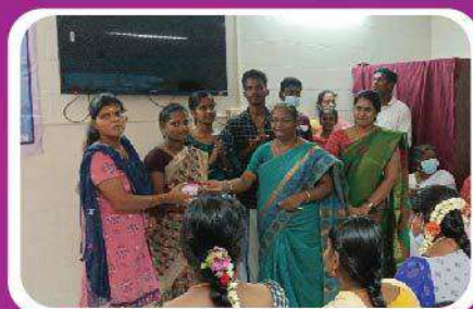
Community Awareness on Safe mother hood day