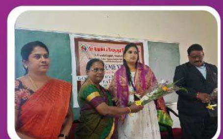
Placement cell programme