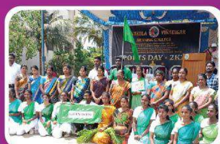
Sports day celebration 2022-23